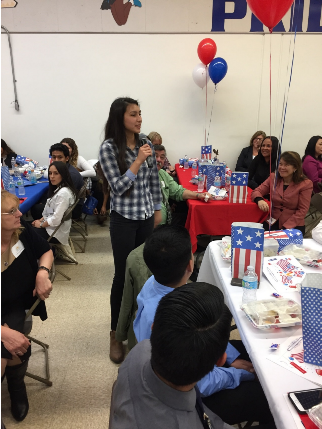
A student delights the audience with her recap of her day learning about local government.