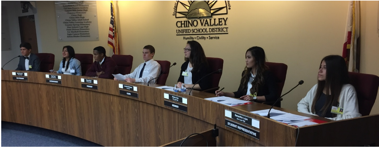
Students portray the school board and superintendent during the mock meeting.