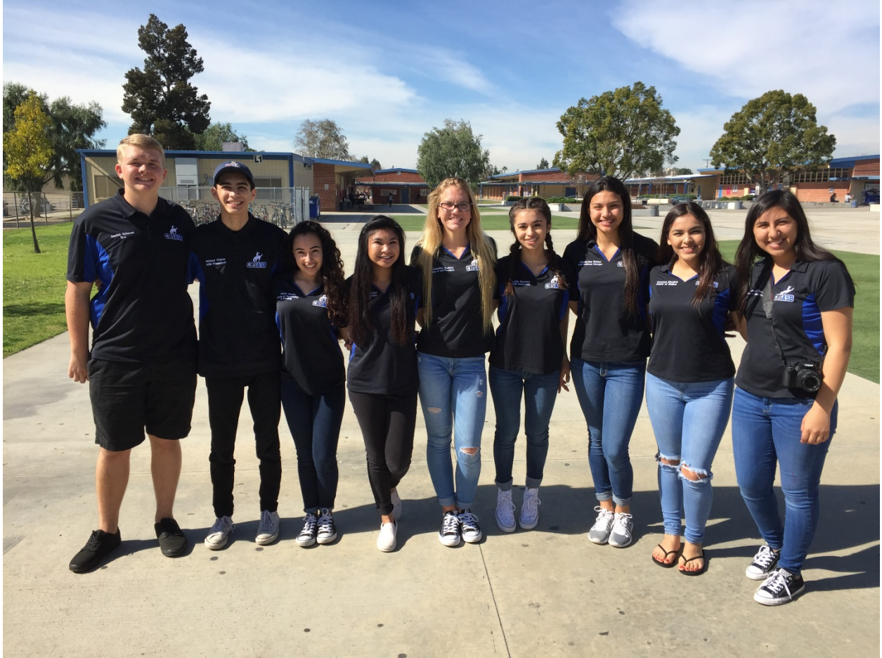
Pictured are some of the Chino High leadership students who helped decorate the school's multi-purpose room and assist visitors to the Student Government Day Luncheon.