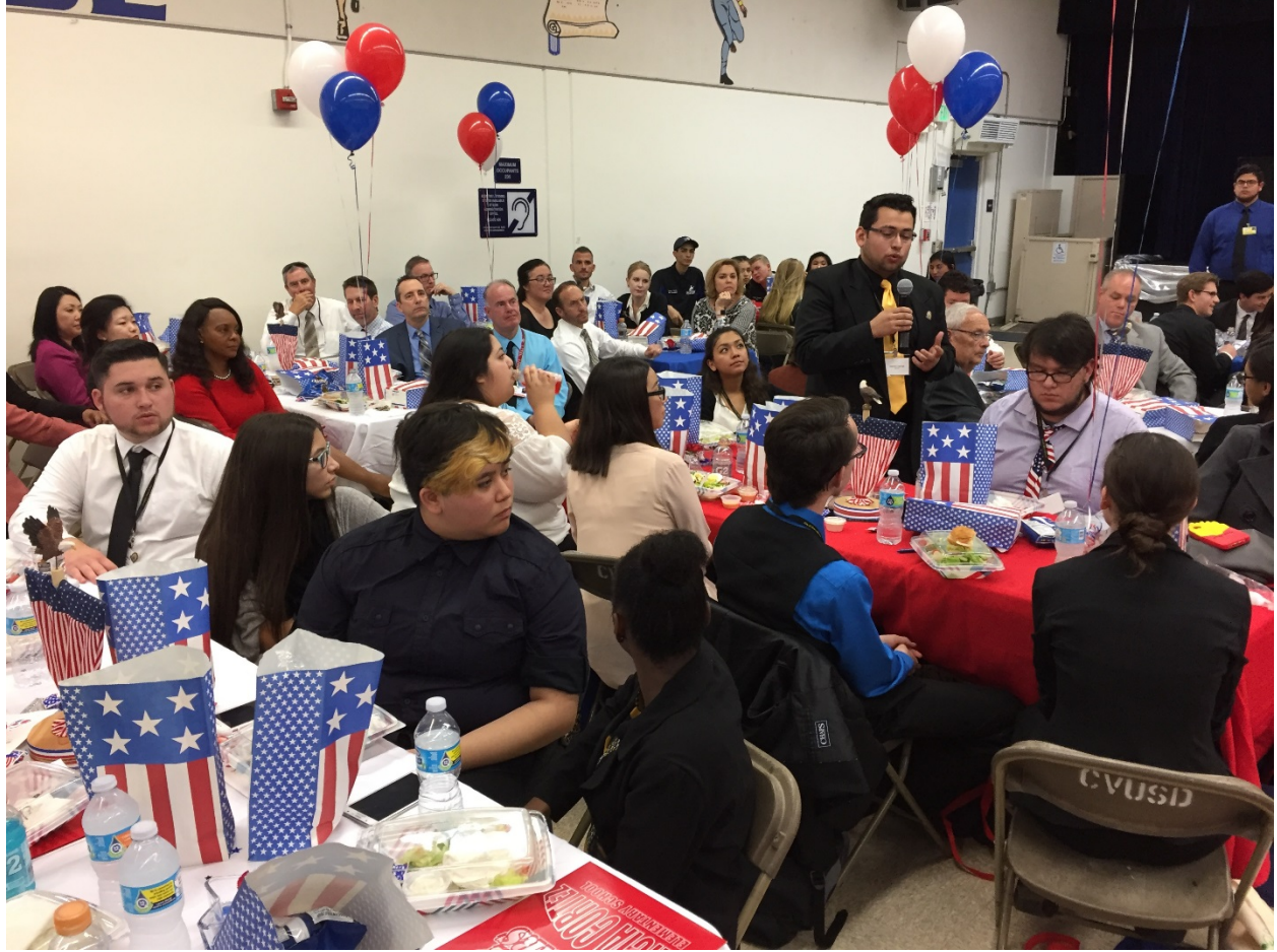
A student talks about the importance of learning how local government works.