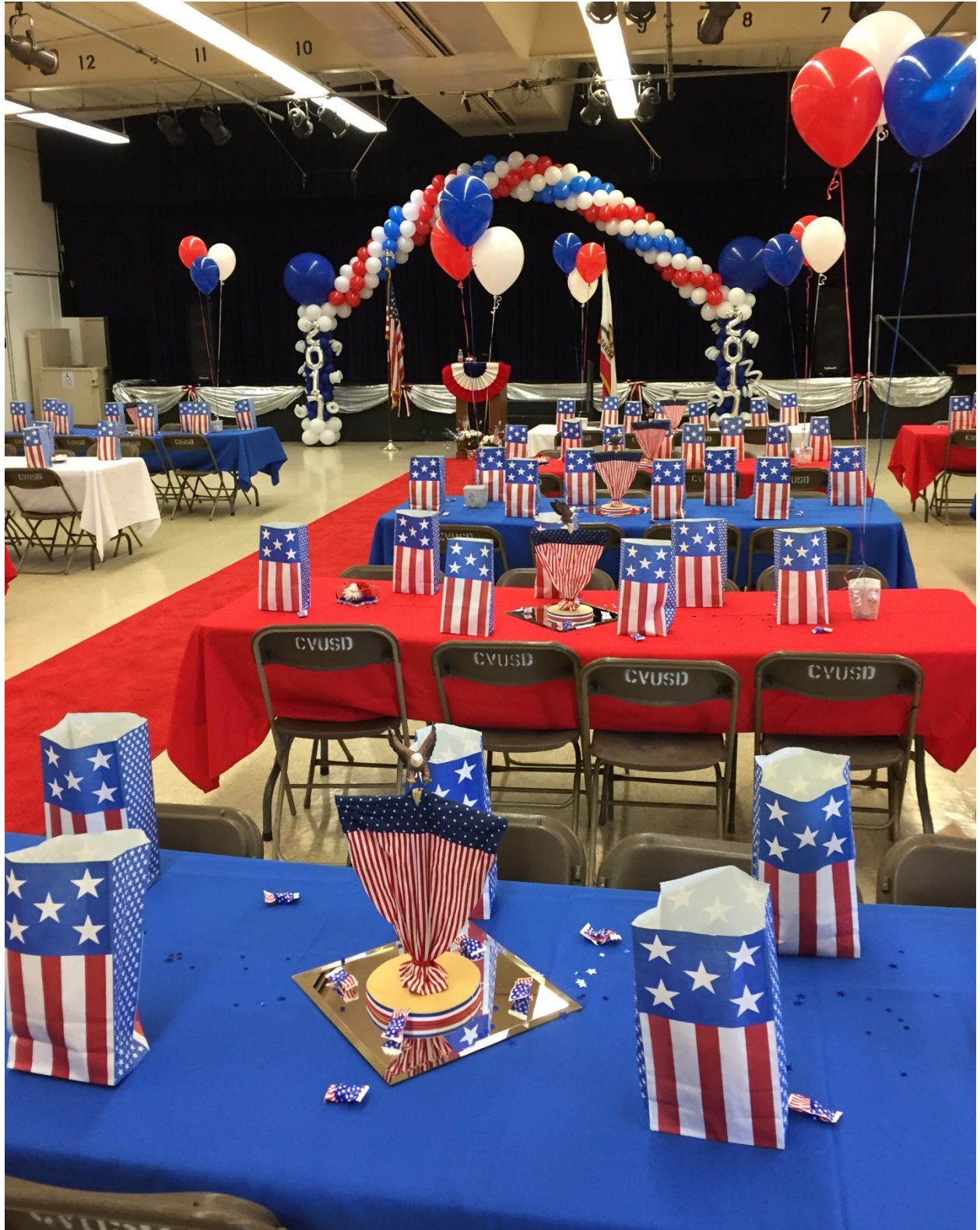
The Chino High multi-purpose room is decorated in a patriotic theme for the Student Government Day Luncheon.