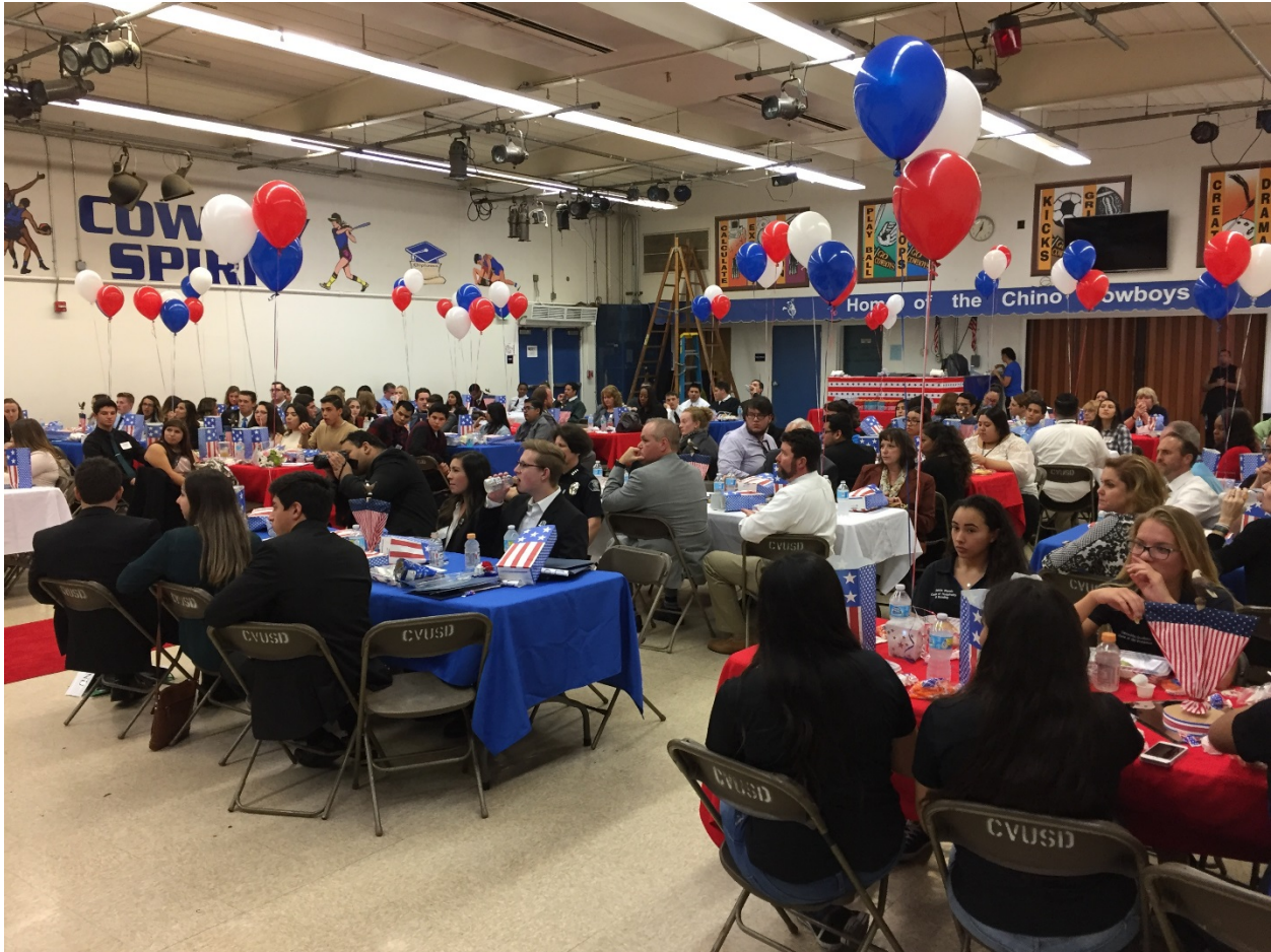
The Chino High multi-purpose room is packed with students, school site and school district administrators during the Student Government Day Luncheon.