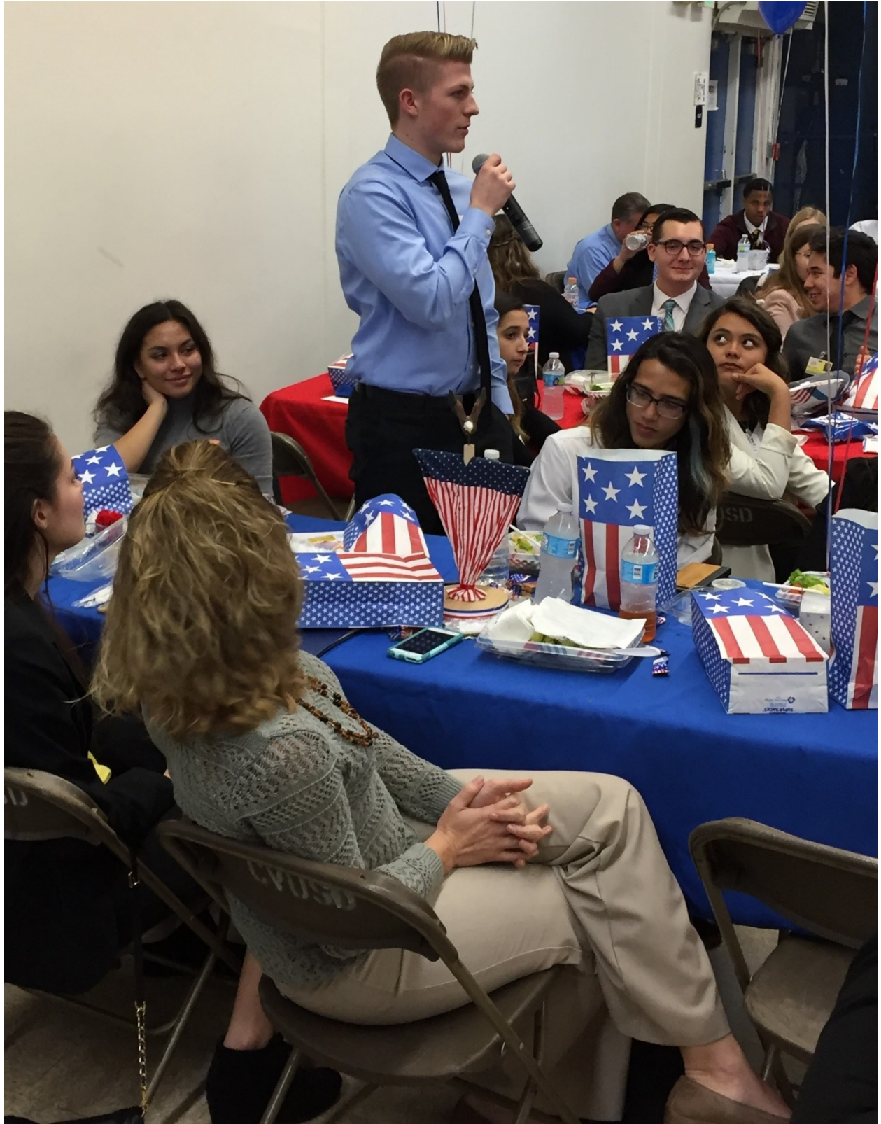
A student talks about his Student Government Day experience.