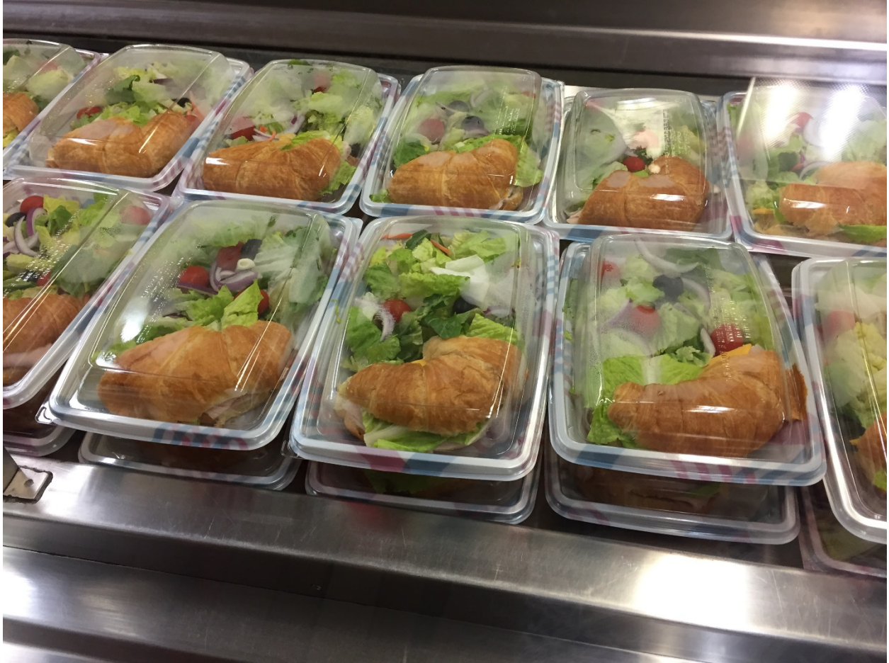
Chino Valley Unified School District caterer Vicki Gullotti prepared food for the luncheon, including these turkey sandwiches and salad.