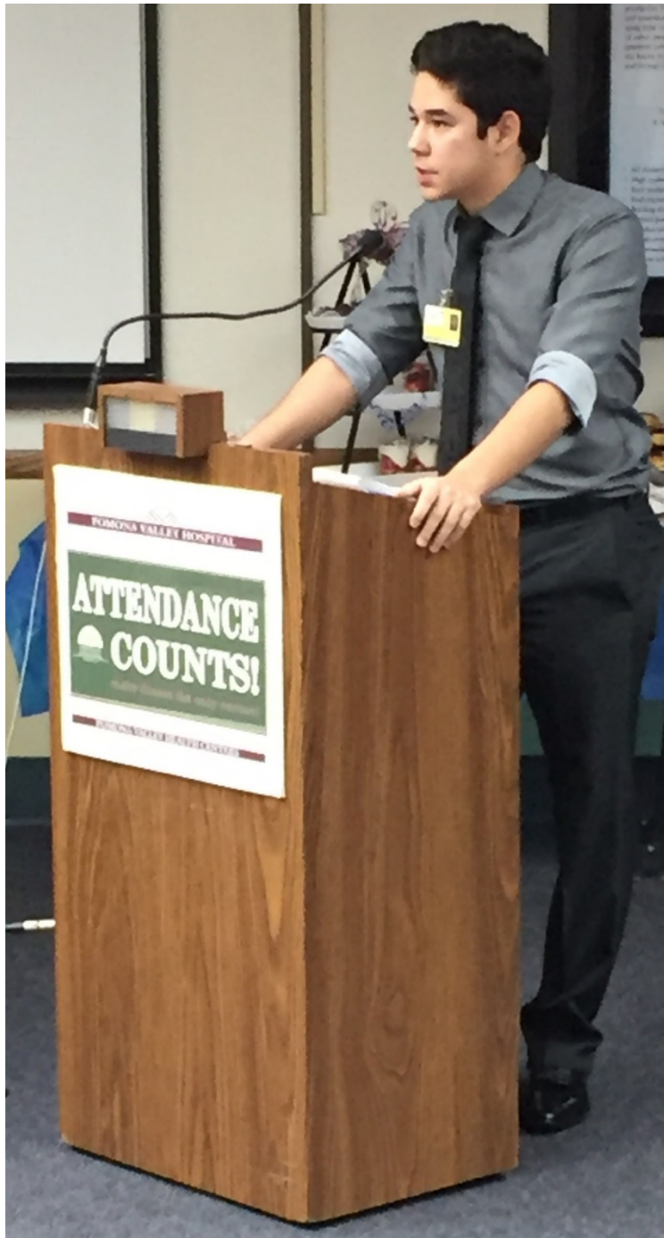
A student speaks about one of the proposed actions on the mock school board meeting agenda.