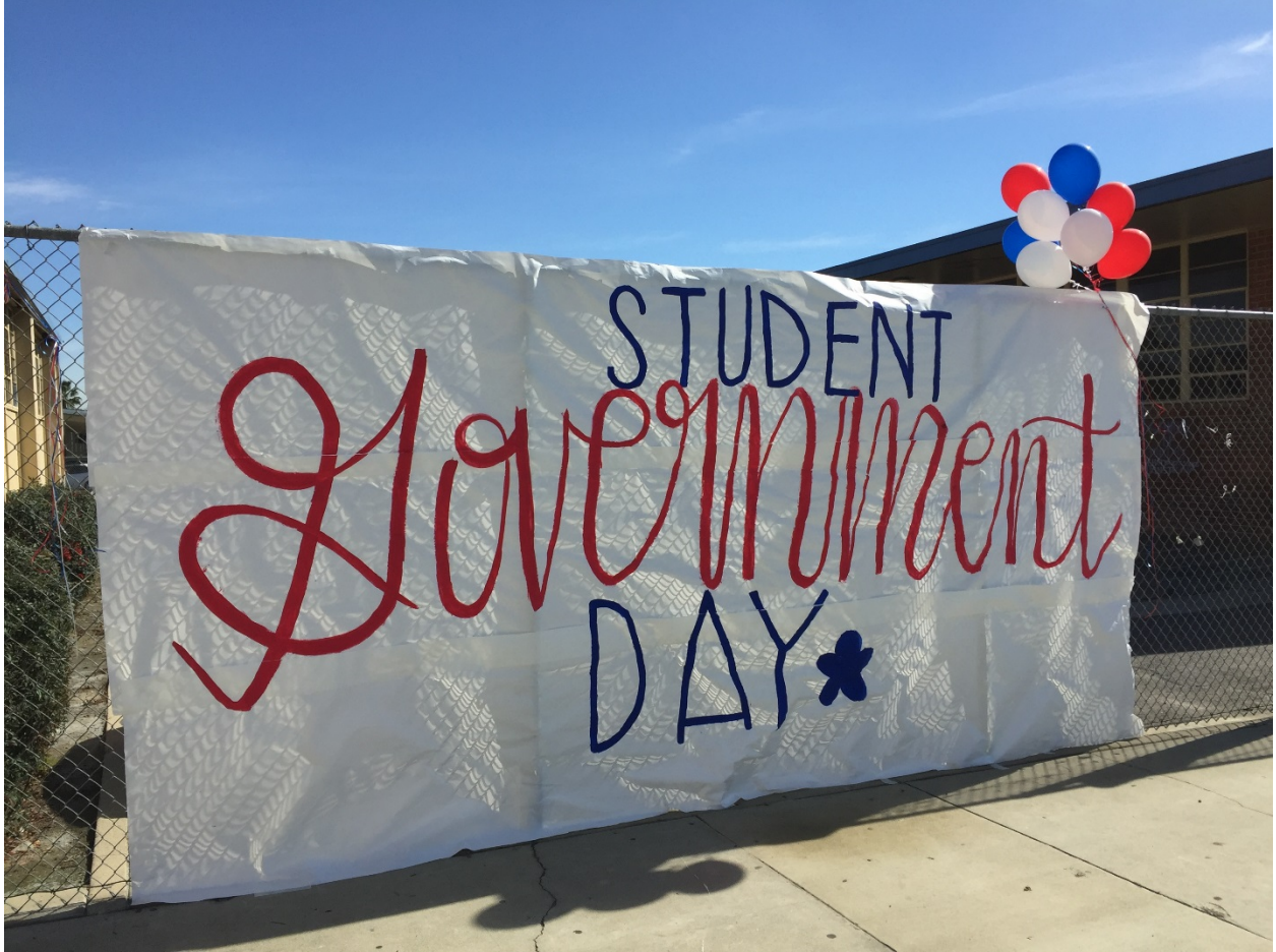
Those attending the Student Government Day Luncheon at Chino High are greeted with this sign, made by Chino High leadership students.